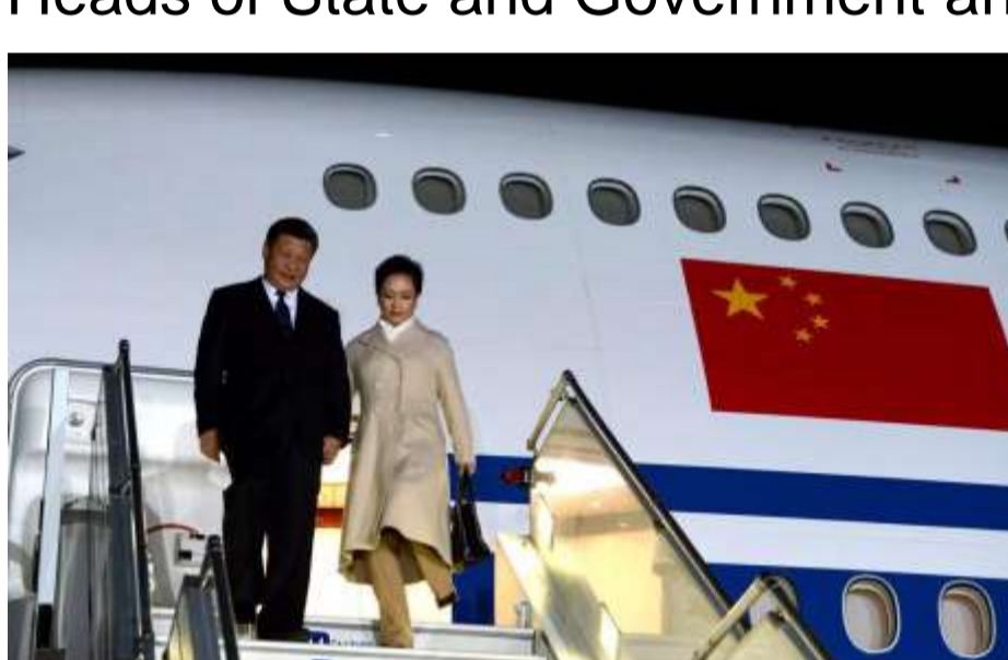
His Excellency Xi Jinping, President of the People's Republic of China and First Lady Peng Liyuan, arrive at the Waterkloof Air Force Base, 23 July 2018. President Jinping paid a State Visit to South Africa on 24 July ahead of the 10th BRICS Summit