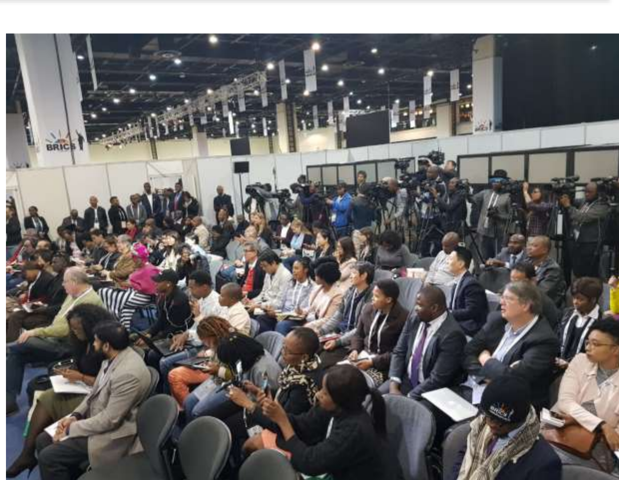
Members of the media attending the BRICS state of readiness briefing by Minister Sisulu at the BRICS Media Centre, Sandton Convention Centre, on 23 July 2018

"We are continuing with the BRICS practice initiated by our previous Chair, the People's Republic of China, to organise a BRICS-Plus Initiative. Through this initiative, BRICS aims to reach out to fellow developing and emerging market economies. In this respect, we have invited the leaders of the following countries and regional organisations who have accepted our invitation to participate in the Summit."