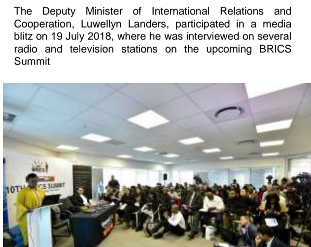
BRICS Media Roundtable, Invest SA, Sandton, 19 July 2018