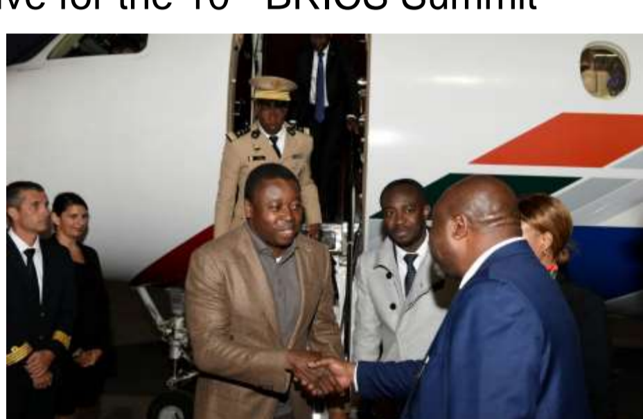
His Excellency Mr Faure Gnassingbé, President of Togo, is received by Minister Thulas Nxesi at the OR Tambo International Airport, 24 July 2018