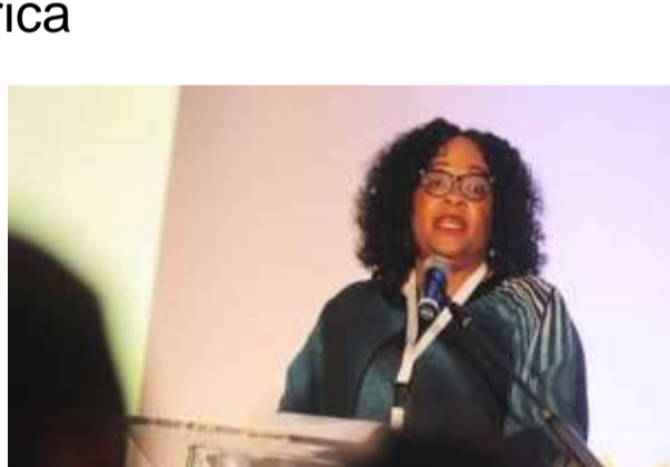
Minister of Communication, Ms Nomvula Mokonyane Addressing BRICS Media Forum

The BRICS Media Forum was initiated by Xinhua News Agency and supported by Brazil's CMA Group, Russia's Sputnik News Agency and Radio, India's The Hindu Group and South Africa's Independent Media.