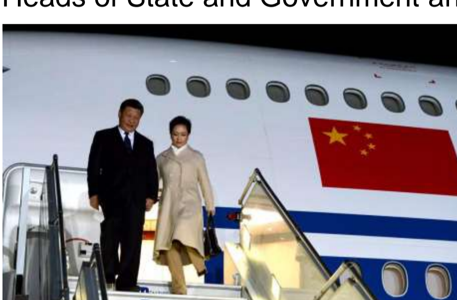
His Excellency Xi Jinping, President of the People's Republic of China and First Lady Peng Liyuan, arrive at the Waterkloof Air Force Base, 23 July 2018. President Jinping paid a State Visit to South Africa on 24 July ahead of the 10th BRICS Summit