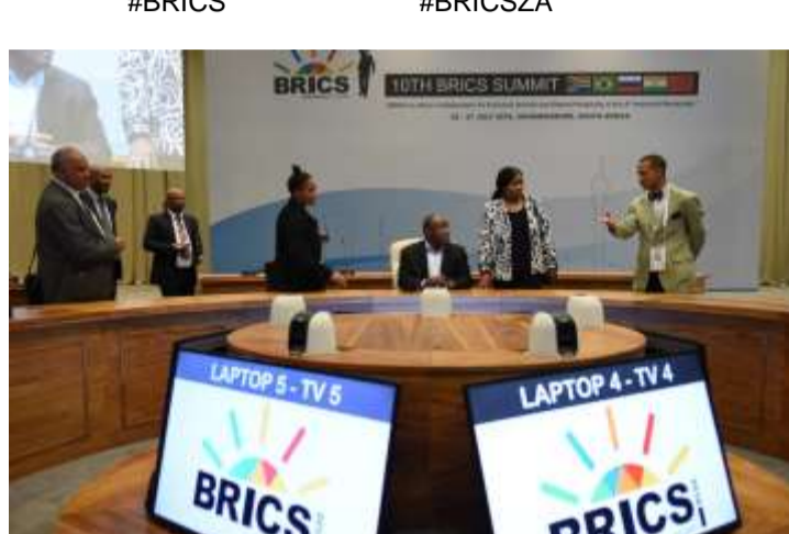
President Ramaphosa receiving a briefing on the status of preparations for the 10th BRICS Summit, 23 July 2018