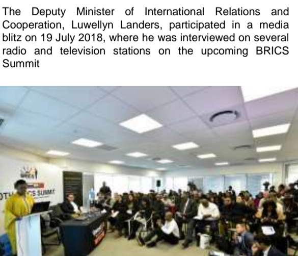
BRICS Media Roundtable, Invest SA, Sandton, 19 July 2018