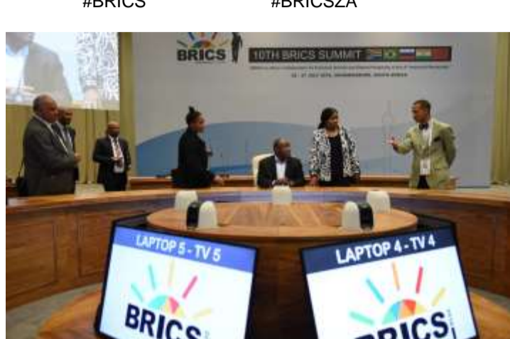
President Ramaphosa receiving a briefing on the status of preparations for the 10th BRICS Summit, 23 July 2018