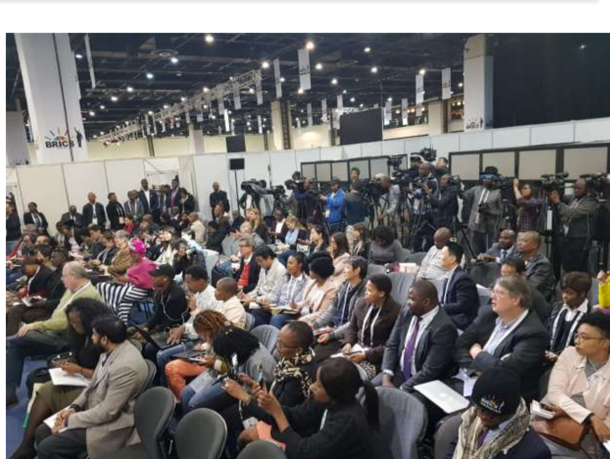
Members of the media attending the BRICS state of readiness briefing by Minister Sisulu at the BRICS Media Centre, Sandton Convention Centre, on 23 July 2018

"We are continuing with the BRICS practice initiated by our previous Chair, the People's Republic of China, to organise a BRICS-Plus Initiative. Through this initiative, BRICS aims to reach out to fellow developing and emerging market economies. In this respect, we have invited the leaders of the following countries and regional organisations who have accepted our invitation to participate in the Summit."