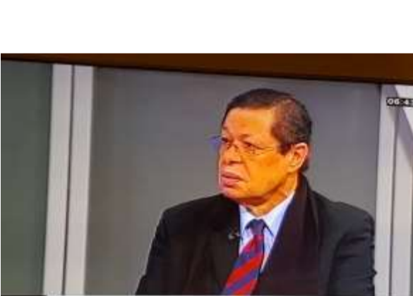
The Deputy Minister of International Relations and Cooperation, Luwellyn Landers, participated in a media blitz on 19 July 2018, where he was interviewed on several radio and television stations on the upcoming BRICS Summit