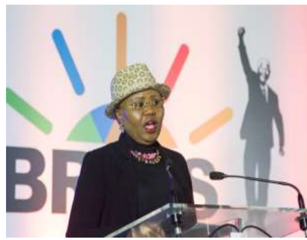
Minister of Small Business Development, Ms Lindiwe Zulu addressing delegates at the Youth Summit

Addressing young people in 1995 on Youth Day, former President Nelson Mandela said: "At the end of the day, your progress will depend on how you apply yourselves to your work. The road to a better life demands hard work. It demands discipline, patience and responsibility ... This generation of youth stands at the borderline between the past of oppression and repression, and the future of prosperity, peace and harmony".