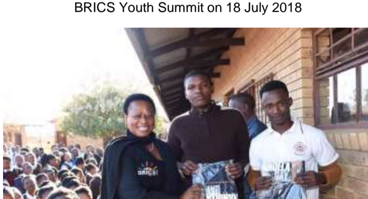
The Deputy Minister also participated at the Mandela Day celebrations earlier in the day where she donated sanitary towels at Raeleng High School