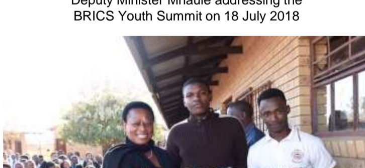
The Deputy Minister also participated at the Mandela Day celebrations earlier in the day where she donated sanitary towels at Raeleng High School