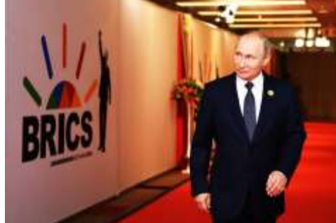
President of the Russian Federation, HE Mr Vladimir Putin