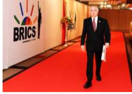
President of the Federative Republic of Brazil, HE Mr Michel Temer

President Cyril Ramaphosa is leading the South African government in hosting the 10th BRICS Summit in Johannesburg.