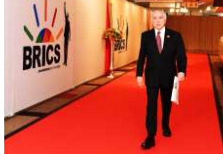
President of the Federative Republic of Brazil, HE Mr Michel Temer

President Cyril Ramaphosa is leading the South African government in hosting the 10th BRICS Summit in Johannesburg.