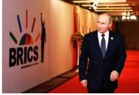
President of the Russian Federation, HE Mr Vladimir Putin