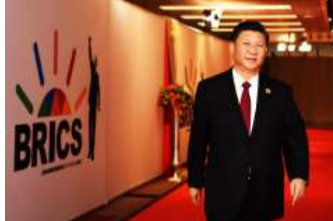
President of the People's Republic of China, HE Mr Xi Jinping

This is the first occasion on which President Ramaphosa hosted the Summit, following his election as President of South Africa in February 2018. This morning, the President welcomed his counterparts from Brazil, Russia, India and China at the Sandton Convention Centre in Johannesburg where he chaired two meetings of the BRICS leaders.