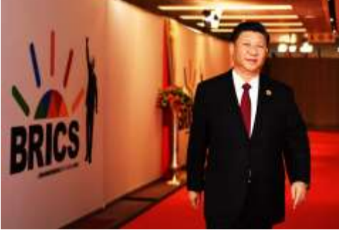
President of the People's Republic of China, HE Mr Xi Jinping

This is the first occasion on which President Ramaphosa hosted the Summit, following his election as President of South Africa in February 2018. This morning, the President welcomed his counterparts from Brazil, Russia, India and China at the Sandton Convention Centre in Johannesburg where he chaired two meetings of the BRICS leaders.