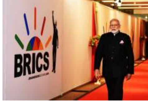
President of the Republic of India, HE Mr Narendra Modi