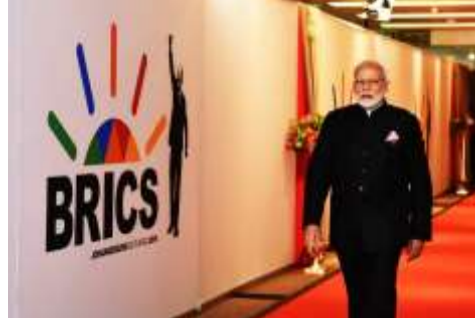
President of the Republic of India, HE Mr Narendra Modi