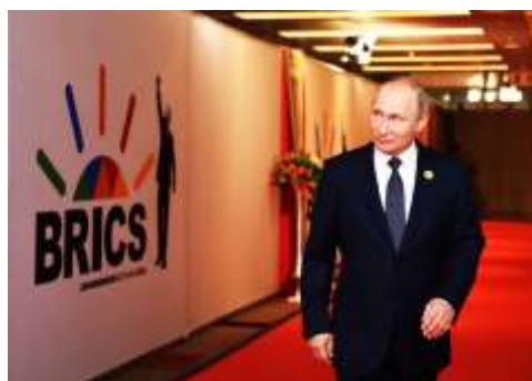
President of the Russian Federation, HE Mr Vladimir Putin