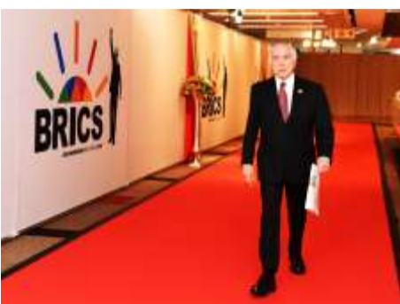
President of the Federative Republic of Brazil, HE Mr Michel Temer

President Cyril Ramaphosa is leading the South African government in hosting the 10th BRICS Summit in Johannesburg.