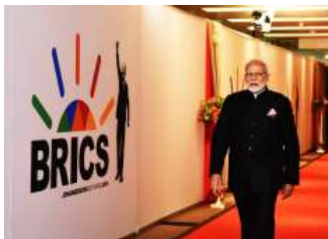
President of the Republic of India, HE Mr Narendra Modi