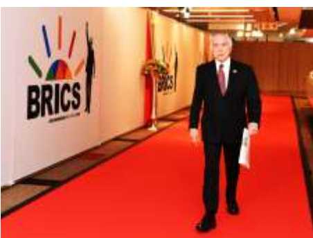
President of the Federative Republic of Brazil, HE Mr Michel Temer

President Cyril Ramaphosa is leading the South African government in hosting the 10th BRICS Summit in Johannesburg.