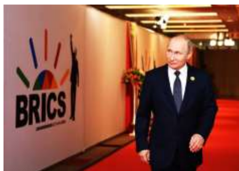
President of the Russian Federation, HE Mr Vladimir Putin