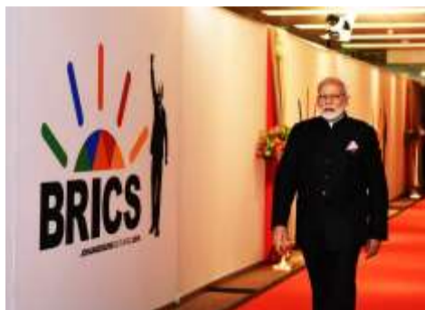
President of the Republic of India, HE Mr Narendra Modi