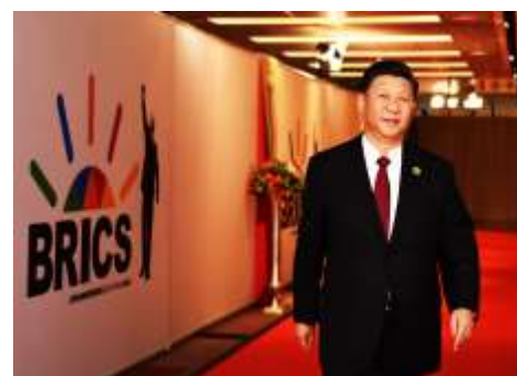
President of the People's Republic of China, HE Mr Xi Jinping

This is the first occasion on which President Ramaphosa hosted the Summit, following his election as President of South Africa in February 2018. This morning, the President welcomed his counterparts from Brazil, Russia, India and China at the Sandton Convention Centre in Johannesburg where he chaired two meetings of the BRICS leaders.