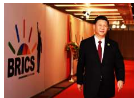
President of the People's Republic of China, HE Mr Xi Jinping

This is the first occasion on which President Ramaphosa hosted the Summit, following his election as President of South Africa in February 2018. This morning, the President welcomed his counterparts from Brazil, Russia, India and China at the Sandton Convention Centre in Johannesburg where he chaired two meetings of the BRICS leaders.